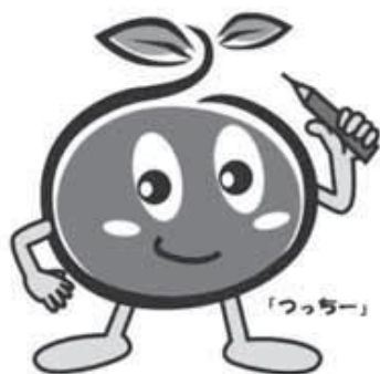
(“Utchii” Mascot Character for the Agriculture and Forestry Census)

Contact: Information Implementation Division Phone: 33-1003