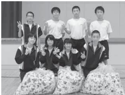
Tomiura Middle School Beautification Club