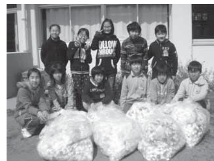
Tomiura Elementary Student Council