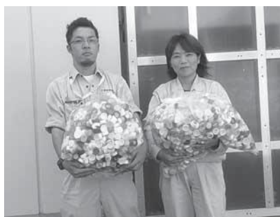
Miura Construction Company