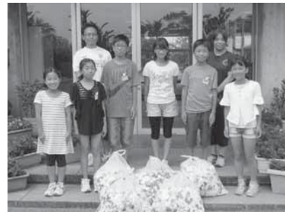
Miyoshi Elementary School