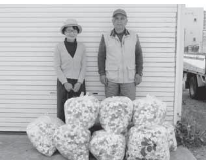
The City Volunteer Team