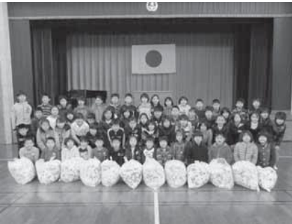
Nanaura Elementary School