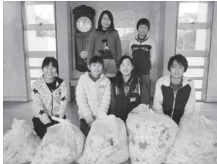
Asaina Elementary Student Council