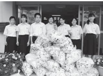
Miyoshi Middle School